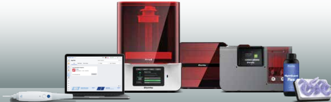
MEDIT i700 SCANNER